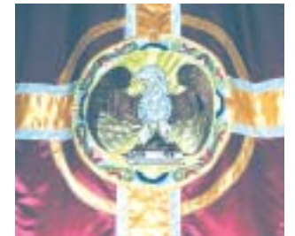
Centerpiece of our parish banner

Charleston is an attractive, compact, easy-to-live-in city, and Saint John's, with its active community of Christians committed to social betterment, seeks to make it more so.