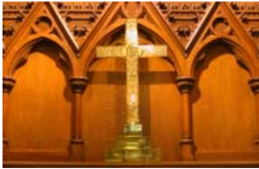
Saint John's high altar cross