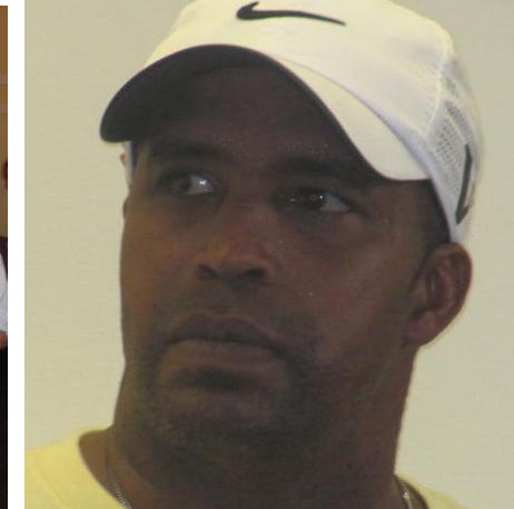
More from the New Kitchen Manna Meal Dedication this summer.