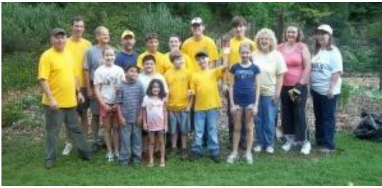
Scouts, organized by the Canfield family, bring a huge crew of volunteers to help out today!