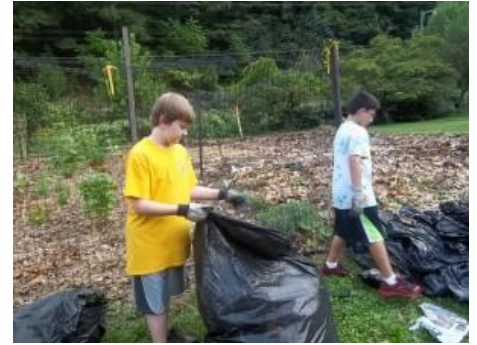
Scouts at work!