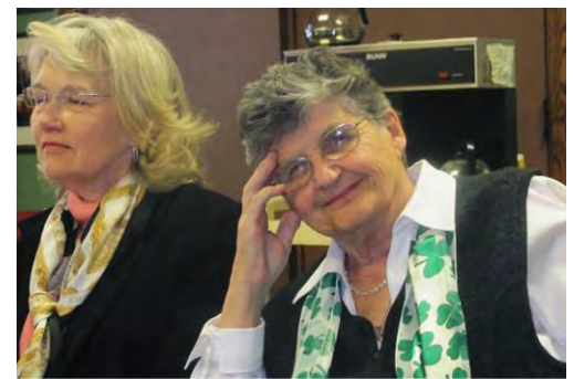
Some Activities That Have Been Going On at St. John's -- Can You Find Yourself in One of These Photos?