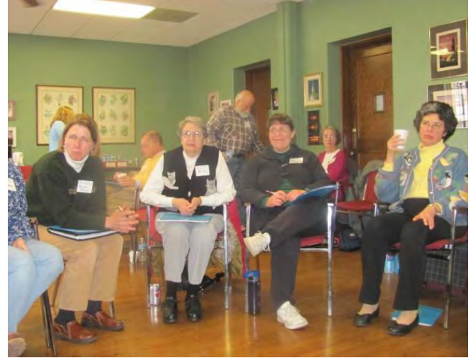
Participants attending the retreat