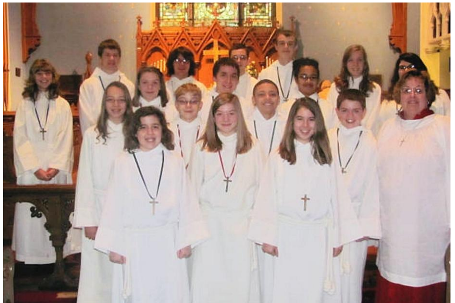
Group