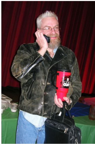
Stephen Blake, an alternate photographer for Interchange