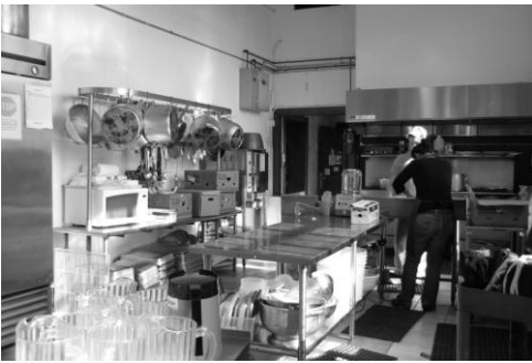
Once - a too small, outdated kitchen...

After years of struggling to serve two meals daily from a too small, outdated kitchen, followed by many months of no kitchen at all, Manna Meal had reason to celebrate. The brand new facility was officially dedicated at an open house on Monday, July 25, through the generosity of the Henry B. Wehrle Jr. Family.