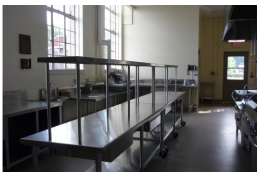
Helen's New Kitchen!